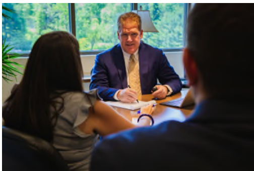
1Q2025 Growth in New Client Relationships

*This award was issued on 6/1/24 by Five Star Professional (FSP) for the time period 9/12/23 through 3/29/24. Fee paid for use of marketing materials. Self-completed questionnaire was used for rating. This rating is not related to the quality of the investment advice and based solely on the disclosed criteria. 1,854 Pittsburgh-area wealth managers were considered for the award; 231 (13% of candidates) were named 2024 Five Star Wealth Managers.