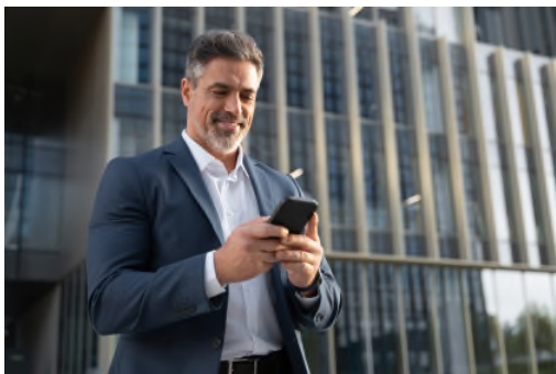
Have You Downloaded the MCWS Mobile App?